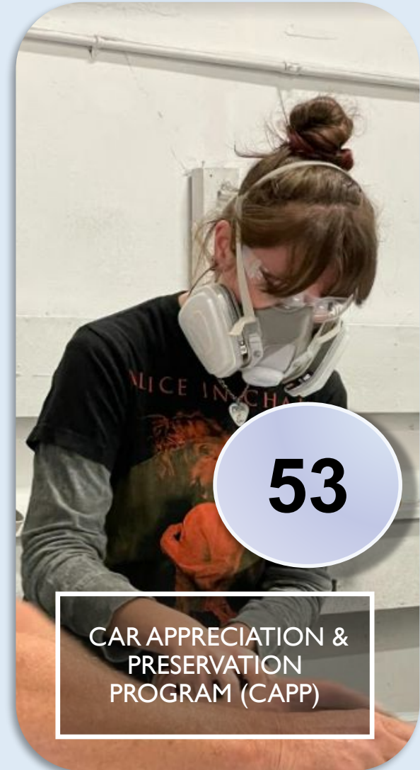
CAR APPRECIATION & PRESERVATION PROGRAM (CAPP)